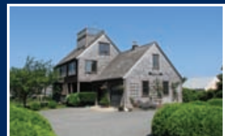
SCONSET - Bedrooms: 3, Bathrooms: 2.5 $2,850,000 Brian Sullivan