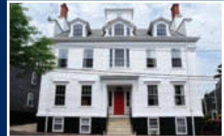
TOWN - Bedrooms: 7, Bathrooms: 4.5 $5,995,000 Gary Winn