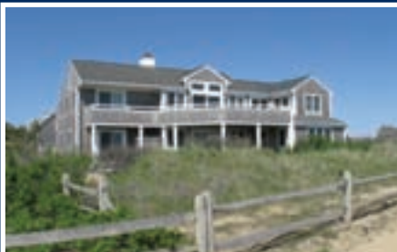
CISCO - Bedrooms: 5, Bathrooms: 4.5 $3,995,000 Gary Winn