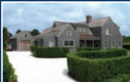
MID ISLAND - Bedrooms: 5, Bathrooms: 5.5 $2,495,000 Gary Winn