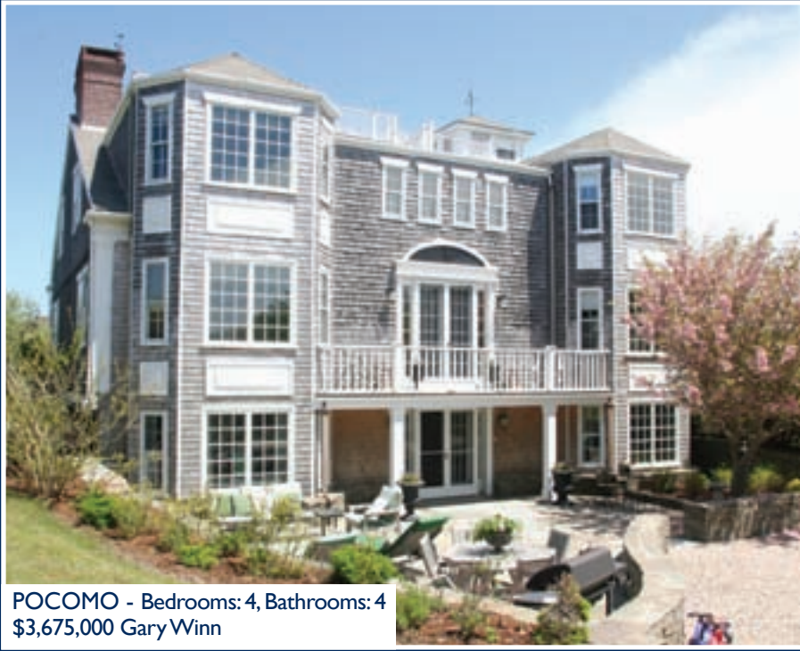
POCOMO - Bedrooms: 4, Bathrooms: 4 $3,675,000 Gary Winn

Sales / Cell: 508.414.1878 Office: 508.228.1881 ext. 132 sully@maurypeople.com