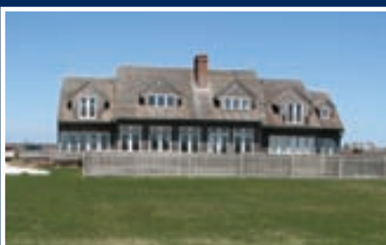
TOM NEVERS - Bedrooms: 5, Bathrooms: 4.5 $2,895,000 Brian Sullivan & Bernadette Maglione