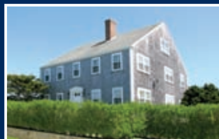
CLIFF - Bedrooms: 4, Bathrooms: 3.5 $2,690,000 Brian Sullivan