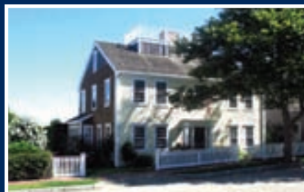
TOWN - Bedrooms: 4, Bathrooms: 3 $3,995,000 - Furnished, Gary Winn