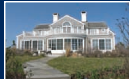
SQUAM - Bedrooms: 7, Bathrooms: 8+ $16,450,000 Gary Winn