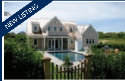
TOWN - Bedrooms: 5, Bathrooms: 5.5 $3,200,000 Brian Sullivan