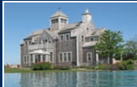
WAUWINET - Bedrooms: 9, Bathrooms: 7.5 $5,995,000 Gary Winn