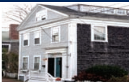
TOWN - Bedrooms: 5, Bathrooms: 6 $1,695,000 Gary Winn