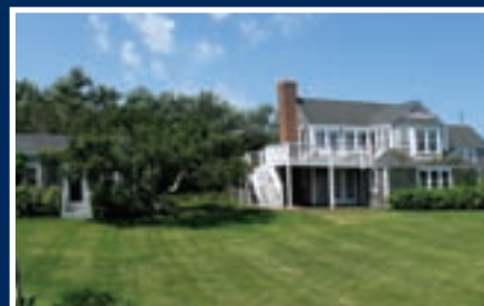
QUIDNET - Bedrooms: 3, Bathrooms: 2 $3,250,000 Gary Winn