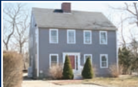
NAUSHOP - Bedrooms: 5, Bathrooms: 4.5 $1,250,000 Gary Winn