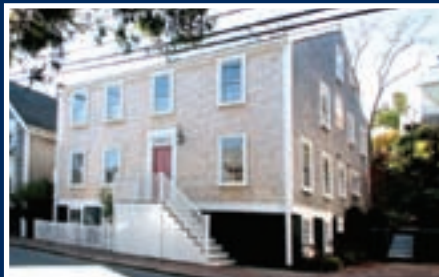
TOWN - Bedrooms: 5, Bathrooms: 5.5 $3,250,000 Brian Sullivan