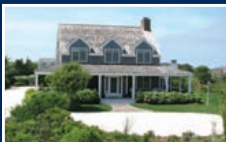
CISCO - Bedrooms: 4, Bathrooms: 3.5 $3,745,000 Gary Winn