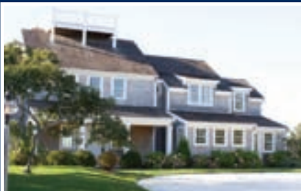
SHIMMO - Bedrooms: 7, Bathrooms: 7+ $7,950,000 Gary Winn