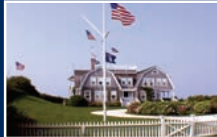
CLIFF - Bedrooms: 5, Bathrooms: 4.5 $23,500,000 Gary Winn