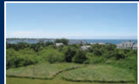
SHIMMO - Bedrooms: 6, Bathrooms: 5 $10,500,000 Gary Winn